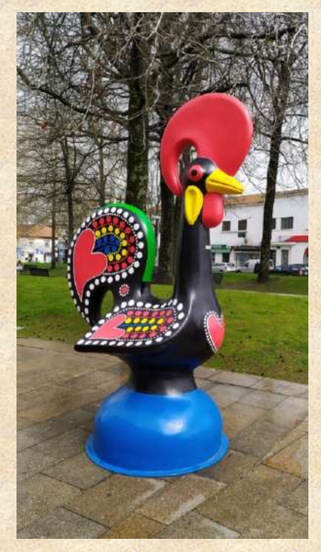
Galo de Barcelos

The rooster of Barcelos is often used as a symbol of Portugal. Barcelos is closely associated with the folk tale which tells the story about a dead rooster's miraculous intervention in proving the innocence of a man who had been falsely convicted and sentenced to death.