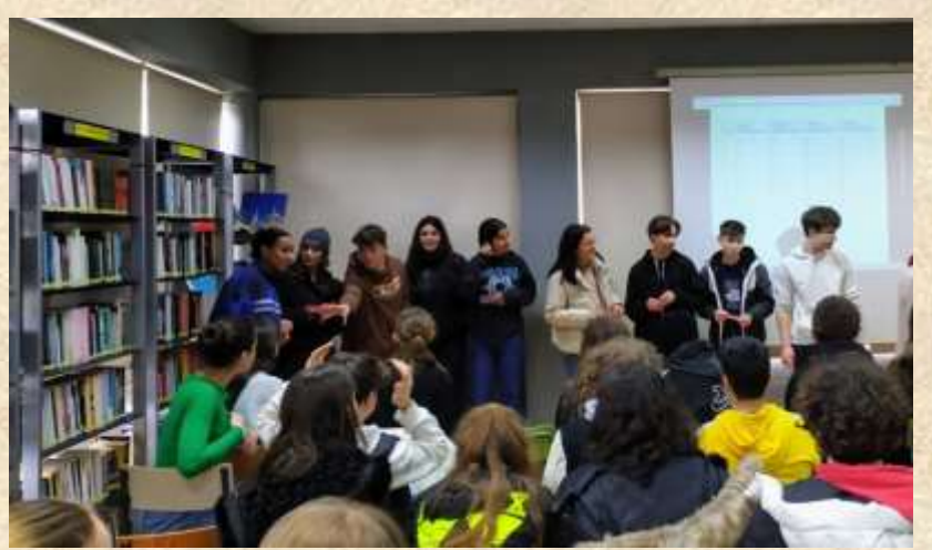
Winners got some prizes

Students were divided into four international groups and through a game they found information about history and culture of Barcelos.